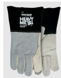
Welder's Gloves - Watson Gloves Heavy Metal Welding Leather Work Gloves