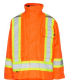
Coats and Vests - Kosto High-Visibility Outdoor Raincoat