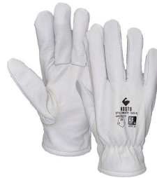
Welder's Gloves - Kosto Goatskin Arc Flash and A5 Cut-Resistant Driver Gloves with Kevlar®