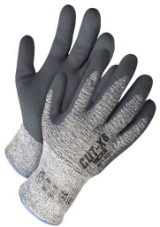
Coated Gloves - Bob Dale Cut-X Nitrile Coated Cut-Resistant A6 Work Gloves