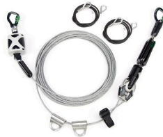
Horizontal Lifeline - MSA Galvanized Temporary Horizontal Lifeline System for Two People