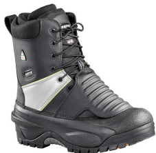
Lined Work Boots - Baffin Blastcap External Metatarsal Protection Winter Boots