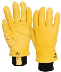
Leather Gloves - Kosto Sheepskin Winter Driver Gloves