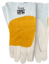
Welder's Gloves - Watson Gloves Mad Cow Leather Safety Gloves for Mig Welding