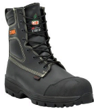
Work Boots - Unik Terminator Heat Resistant with Internal Metguard Boots