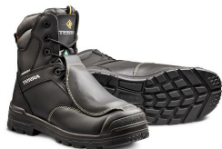
Work Boots with Metatarsal Protector - Terra Barricade 8" Composite Toe Safety Work Boot with External Met Guard