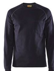
Sweaters and Polos - Blaklader Lightweight CAT 2 FR Long Sleeve Work T-Shirt