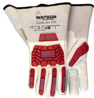
Winter Gloves - Watson Gloves Winter Van Goat Gauntlet Style Cuff Gloves