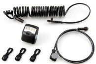
Welding masks and accessories - 3M™ 46-0500-01 Task Light Kit for Speedglas™ G5-01 Helmet SPI #: RPR145