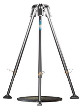
Rescue Tripod - Globestock Sentry Confined Space Tripod Anchor