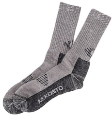
Socks - Kosto Merino Work Socks Performance+