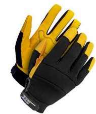
Leather Gloves - Bob Dale Gloves 20-1-1214 Grain Goatskin Mechanics Work Gloves with Padded Palms