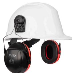
Earmuffs - PIP® V3™ Cap Mounted Passive Ear Muff - NRR 26