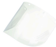
Faceshields - PIP Dynamic™ Universal Fit PETG Safety Visor SPI #: YVI089