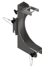
Other Fall Protection Accessories - Mounting Bracket for Globestock Stop and Saver Lifelines compatible with Xtirpa System