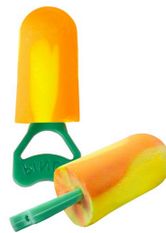
Earplugs - PIP Pinchfit™ BioSoft™ Disposable Bio-based Foam Earplugs