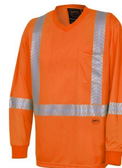
Sweaters and Polos - Pioneer Coolpass® Ultra-breathable UV Protection Work Shirt