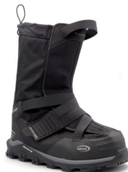
Overshoes - Surewex Neos Klondike PG Insulated Robust Overshoes