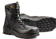
Work Boots - Terra Argo 8" Metal-free Work Boots