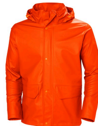
Coats and Vests - Helly Hansen Gale Waterproof Breathable Rain Jacket