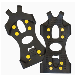
Cleats - Kosto Non-Slip Cleats K- Grip