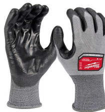
Coated Gloves - Milwaukee Cut Level A4 High-Dexterity Polyurethane Dipped Gloves