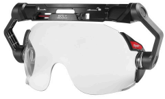
Faceshields - Milwaukee Bolt™ Eye Visor with Clear Dual Coat Lens SPI #: YVI240