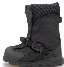
Overshoes - Neos Explorer Insulated Overshoes with Glacier Trek™ Outsoles