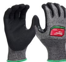
Coated Gloves - Milwaukee Cut Level A6 High-Dexterity Nitrile Dipped Gloves