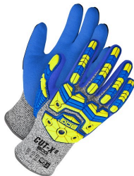
Cut-Resistant Gloves - Bob Dale Gloves Cut-X Nitrile Coated A8 Cut and Impact Resistant Work Gloves