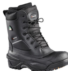
Lined Work Boots - Baffin Men's Waterproof WORKHORSE Insulated Safety Boot