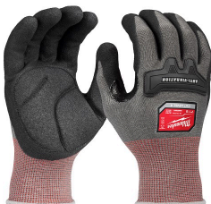
Coated Gloves - Milwaukee Anti- Vibration Cut Level 4 High Dexterity Nitrile Dipped Gloves