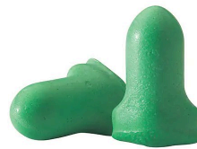
Earplugs - PIP Maximum Lite® LPF-1 Single-Use Uncorded Earplugs