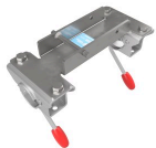
Other Fall Protection Accessories - Mounting Bracket for Xtirpa Winch compatible with Globestock Sentry Tripod