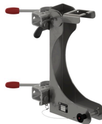
Other Fall Protection Accessories - Mounting Bracket for Globestock Stop and Saver Lifelines compatible with Sentry Tripod