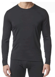
Underwear and Undergarment - Stanfield's Long Sleeve Merino Wool Base Layer Top