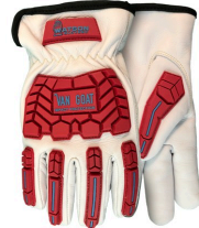
Winter Gloves - Watson Gloves Van Goat Winter Gloves with Impact and A7 cut Resistance