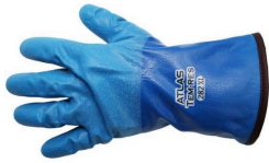
Winter Gloves - SHOWA TEMRES 282 Cold Protection Gloves