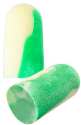
Earplugs - Mega Bullet BioSoft Disposable Eco-Friendly Foam Ear Plugs