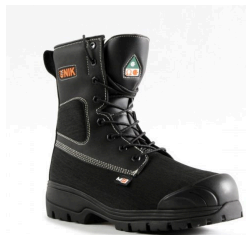
Work Boots with Metatarsal Protector - Unik USF89481 Welder Heat Resistant Metatarsal Boots