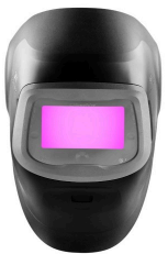
Welding masks and accessories - 3M™ Speedglas™ G5-03 E Economical Welding Helmet with G5NC Auto-Darkening Filter SPI #: YMT027