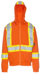
Coats and Vests - Kosto High-Visibility FR Jacket with Detachable Hood and Arc Flash Protection