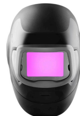
Welding masks and accessories - 3M™ Speedglas™ G5-03 Pro Welding Helmet with G5VC Auto- darkening Lens Filter SPI #: YMT028