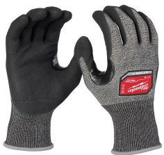
Coated Gloves - Milwaukee Cut Level A4 High-Dexterity Nitrile Dipped Gloves