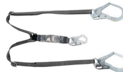
Shock-absorbing lanyards - MSA V-Series Standard Adjustable Shock Absorbing Lanyard