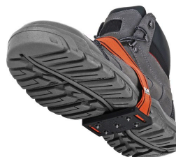
Cleats - Surewex K1 Mid-Sole Low Profile Centered Ice Cleats