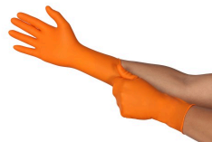
Disposable Gloves - Ansell TouchNTuff™ 93-800 Acetone Resistant Disposable Work Gloves