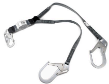
Shock-absorbing lanyards - MSA V-Series 4 ft Fixed Twin Leg Lanyard with Rebar Hooks