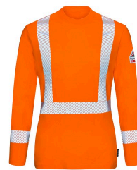
Sweaters and Polos - Bulwark STT5 Flame Resistant High Visibility Women T-Shirt with 8.3 cal Protection