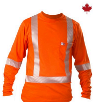
Sweaters and Polos - Big Bill High-Viz FR and Arc-Flash Resistant Work Shirt