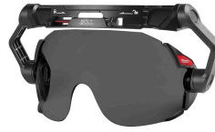
Faceshields - Milwaukee Bolt™ Eye Visor with Clear Dual Coat Lens SPI #: YVI241