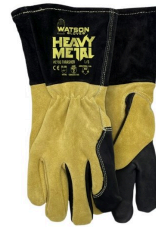
Welder's Gloves - Watson Gloves Heavy Metal 2780 Thrasher Split Cowhide Welding Gloves