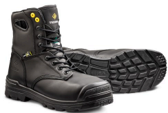
Work Boots - Terra® PALADIN Composite Toe Metal-Free Work Boot with Internal Met Guard