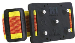
Cleats - Surewex K1 Anti-Spark Ice Cleat with Original Profile