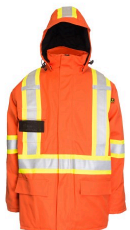
Coats and Vests - Kosto DazzleHigh-Visibility FR Arc-Flash Winter Work Coat