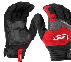
Anti-Vibration gloves - Milwaukee Anti-Vibration Work Gloves