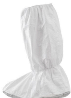
Overshoes - DuPont™ Tyvek® 400 Limited Use Full-Length Boot Covers