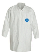
Smocks - DuPont™ Tyvek® 400 Particle-Resistant Limited Use Lab Coat