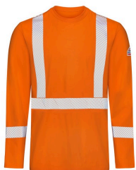
Sweaters and Polos - Bulwark STT4 Flame Resistant High Visibility T-Shirt with 8.3 cal Protection