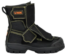
Work Boots - Unik Foundry Molten Metals Resistant Work Boots