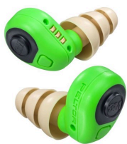
Hearing Protection with Communication Systems - 3M™ Peltor™ EEP-100 Electronic Safety Earplugs