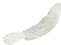
Safety Sleeves - DuPont™ Tyvek® 400 18" Limited Use Protective Sleeve