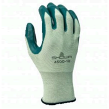
Coated Gloves - Showa 4500 Flexible Nitrile Palm Coated Gloves