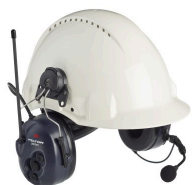
Hearing Protection with Communication Systems - 3M™ PELTOR™ LiteCom FRS Hard Hat Attached Headset