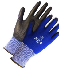
Coated Gloves - Bob Dale Gloves X- Site Nylon Knit Polyurethane Coating Work Gloves