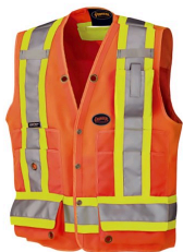
Traffic Vests - Pioneer High Visibility Surveyor's Safety Vest