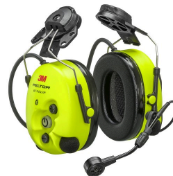
Hearing Protection with Communication Systems - 3M™ PELTOR™ WS ProTac XPI Level Dependent Bluetooth® Headset