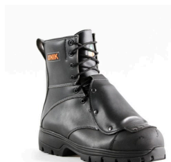
Work Boots with Metatarsal Protector - Unik Chemik Chemical Resistant Metguard Work Boots