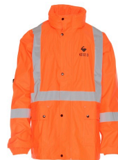
Coats and Vests - Kosto High-Visibility FR Rain Jacket with 360° Reflective Design