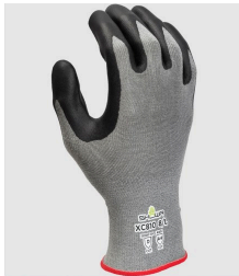
Coated Gloves - Showa DURACoil XC810 Touchscreen-Compatible Nitrile-Coated Gloves