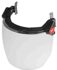
Faceshields - Milwaukee Bolt™ Full Faceshield with Gray Dual Coat Lens SPI #: YVI242