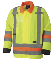
Coats and Vests - Pioneer High-Visibility Breathable Traffic Control Work Jacket