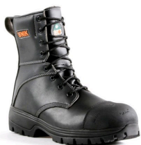
Work Boots - Unik Safety CHEMIK Chemical Safety Boots with Vibram Outsole