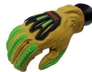
Arc Flash Protection Gloves - Tilsatec Cut and Impact Resistant Leather Work Gloves