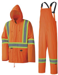
Rainsuits - Pioneer Lightweight High-Visibility and Waterproof Safety Rain Suit