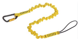
Fall Protection Tools Holders - 3M™ DBI-SALA® Hook2Loop 1500047 Bungee Tool Tether