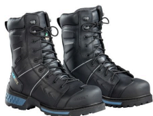
Lined Work Boots - Baffin ICE MONSTER Men's Slip Resistant Winter Safety Boot