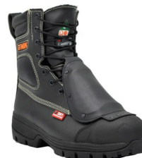
Work Boots - Unik Terminator Waterproof Heat-Resistant Work Boots