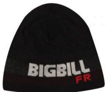
Toques, Balaclavas and Neck Warmers - Big Bill Arc Flash Protective Beanie