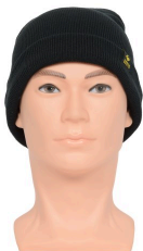
Toques, Balaclavas and Neck Warmers - Kosto Stretchable Knit Toque