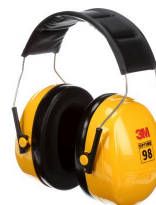
Earmuffs - 3M™ PELTOR Optime 98 Over-the-head Rigid Safety Earmuffs