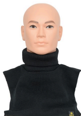
Toques, Balaclavas and Neck Warmers - Kosto Acrylic Thermal Plastron