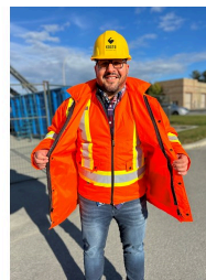
Coats and Vests - Kosto 5 in 1 Winter Jacket with 4" Reflective Tape