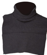
Toques, Balaclavas and Neck Warmers - Acrylic neck warmer