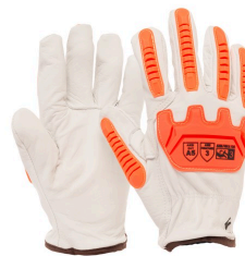
Cut-Resistant Gloves - Kosto Leather High-Impact & A5 Cut-Resistant Gloves with TRP Protection SPI # : MKGV27