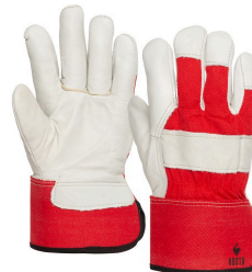
Winter Gloves - Kosto Full-Grain Leather Winter Work Gloves SPI # : MGG312