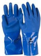
Coated Gloves - Kosto MKC094 Chemical-Resistant PVC Coated Work Gloves SPI # : MKC094