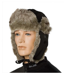
Toques, Balaclavas and Neck Warmers - Ganka Nylon Hat with Synthetic Fur SPI # : THT169L