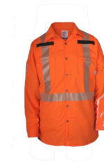
Work Shirts - Big Bill Ripstop Hi-Vis Long Sleeve Shirt