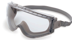
Goggles - Stealth Safety Goggles with Clear Lens and HydroShield Anti-Fog Coating SPI # : YGO104