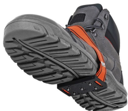
Cleats - Surewerx K1 Mid-Sole Low Profile Centered Ice Cleats