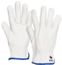
Leather Gloves - Kosto Sheepskin Leather Driver Gloves SPI # : MGG044