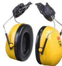
Earmuffs - 3M™ 98 Optime Peltor Helmet Mounted Rigid Earmuffs H9P3E