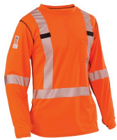
Sweaters and Polos - Big Bill High-Visibility Long-Sleeve Work T-Shirt