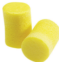
Earplugs - 3M™ E-A-R™ 312-1201 Moisture-Resistant Classic™ Foam Earplugs