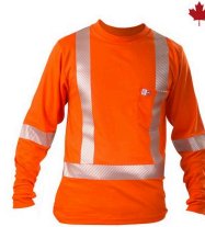
Sweaters and Polos - Big Bill High Visibility Arc Flash Long Sleeve Work Shirt