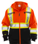
Coats and Vests - Tingley Job Sight High Visibility Polyester Sweatshirt