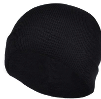
Toques, Balaclavas and Neck Warmers - GKS Wool Beanie