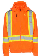
Coats and Vests - Kosto Fleece High-visibility Jacket with Removable Hood