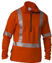
Coats and Vests - Big Bill Flame Resistant High Visibility Thermal Sweatshirt with Half-Zip