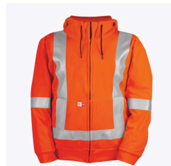
Coats and Vests - Big Bill FR Windproof Arc-Rated Reflective Hoodie with Removable Hood