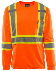
Sweaters and Polos - Kosto High Visibility Long Sleeve Work Shirt