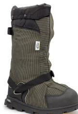
Overshoes - Neos Navigator 5™ Insulated Work Overshoes with Glacier Trek™ Outsoles