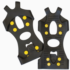
Cleats - Kosto Non-Slip Cleats K-Grip