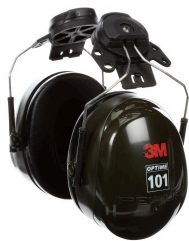
Earmuffs - 3M™ Peltor™ H7P3E Optime Series 101 Helmet Mounted Earmuffs