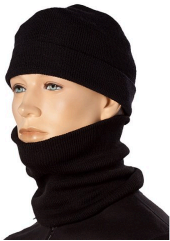
Toques, Balaclavas and Neck Warmers - COVER NECK # 7769111 ACRYL. ASST COLORS SPI # : THC005