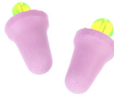
Earplugs - 3M™ No-Touch Uncorded Foam Earplugs – 100 Pairs