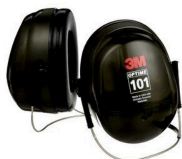
Earmuffs - 3M™ PELTOR™ Optime™ 101 H7B Behind-the-Head Earmuffs for Hard Hat Use