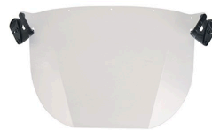
Faceshields - 3M™ Peltor Polycarbonate Protection Faceshield SPI # : YVI18