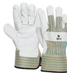
Leather Gloves - Kosto Full-Grain Leather Work Gloves with Cotton Back SPI # : MGG001