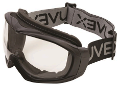
Goggles - Uvex Sub-Zero Winter Safety Goggles with Hydroshield Lens SPI # : 3090.380