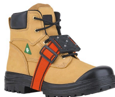
Cleats - Surewerx K1 Mid-Sole Original Profile Centered Ice Cleats