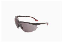
Safety Glasses - Genesis XC Safety Glasses with HydroShield Anti-Fog Coating SPI # : YLUX74-0