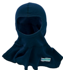
Toques, Balaclavas and Neck Warmers - Stanfield's Naval cowl with fireproof plastron