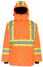
Coats and Vests - Kosto Xtrem Endura Winter Parka with High Visibility Certified CSA