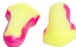
Earplugs - Honeywell Laser Lite® Single-Use Uncorded Earplugs