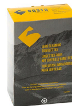
Lens Cleaning Wipes - Kosto Wall-Mounted Distributor of Lens Cleaning Wipes, 100/Box SPI # : YNK002