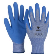
Coated Gloves - Kosto A6 Cut Resistance Gloves with Nitrile Foam Coated Palm SPI # : MKV106