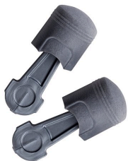
Earplugs - 3M™ E-A-R™ Pistonz Earplugs – 100 Pairs