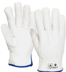
Winter Gloves - Kosto Thinsulate-Lined Sheepskin Driver Gloves SPI # : MKGH03