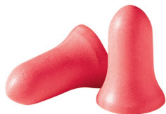
Earplugs - Honeywell Maximum MAX-1 Single-Use Uncorded Earplugs