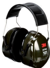
Earmuffs - 3M™ PELTOR™ Optime™ 101 Over-the-Head Earmuffs