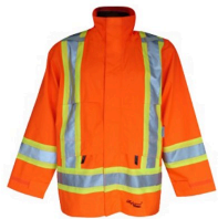
Coats and Vests - Viking Professional® Reflective Journeyman 300D Jacket