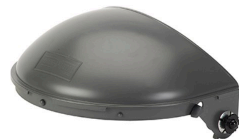
Faceshield Brackets - Visor bracket with Quick-Lok fasteners SPI # : YSC020