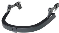
Faceshield Brackets - Honeywell Nylon Faceshield Bracket for Safety Hard Hat SPI # : SN-CP5005