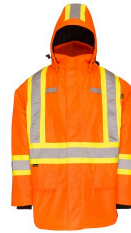
Coats and Vests - Kosto Winter Parka for men with 4 in Reflective Tape