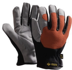
Coated Gloves - Kosto Anti-vibration Mechanic Work Gloves with Optimized Palm Paddings SPI # : MKC090