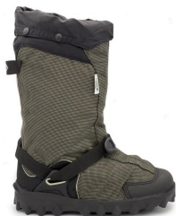
Overshoes - Neos Navigator 15" Lightweight Nylon Overshoes with Foam Polyurethane Insulation