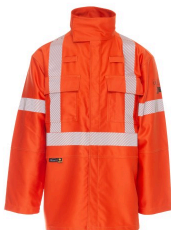
Coats and Vests - Kosto Aluskin Molten Metals and Heat Resistant High Visibility Shirt