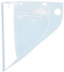
Faceshields - Honeywell Visor with Wide Field of Vision SPI # : YVI00