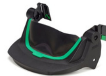
MSA V-Gard H1 Visor Frame with Debris Control