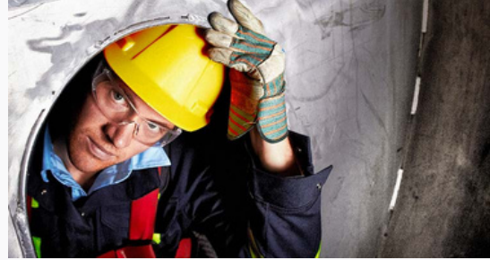
Confined Space Entry & Rescue