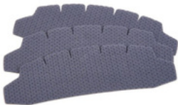
MSA V-Gard H1 Replacement Moisture-Wicking Helmet Sweatband