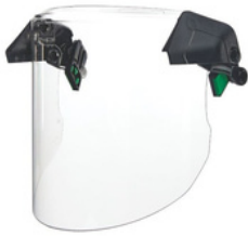
MSA V-Gard Anti-Fog and Impact-Resistant Polycarbonate Clear Face Shield for V-Gard H1