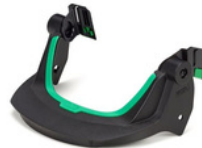
MSA V-Gard H1 Visor Frame without Debris Control