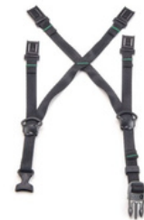
MSA V-Gard H1 Trivent Helmet Chinstrap Replacement