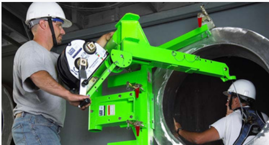
Confined Space Entry and Basic Rescue