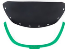
MSA Replacement Debris Control Insert for V-Gard H1 Visor Frame