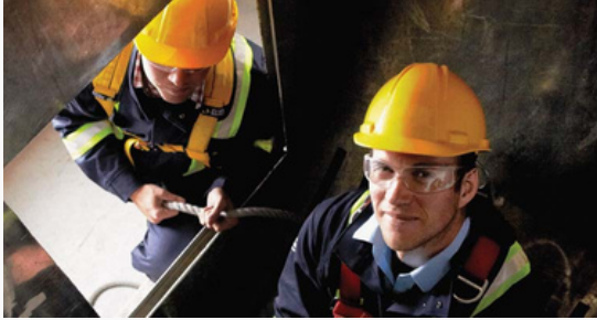
Confined Space Entry and Stand-by Attendant/Supervisor