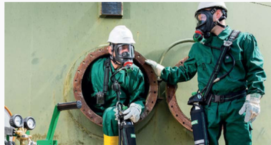
Confined Space: Permit Delivery