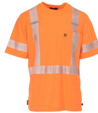
Sweaters and Polos - Kosto Short- Sleeve High-Visibility T-Shirt SPI #: VHK215