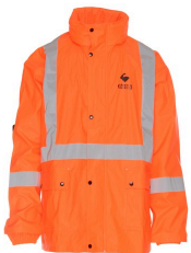
Coats and Vests - Kosto High-Visibility FR Rain Jacket with 360° Reflective Design