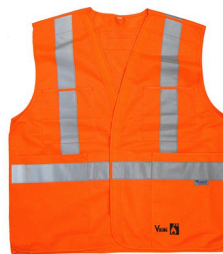
Road safety clothing - Viking Flame-Resistant Traffic Vest SPI #: SVE139