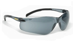
Safety Glasses - Kosto Freedom Series Safety Glasses