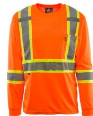
Sweaters and Polos - Kosto High Visibilty Long Sleeve Work Shirt SPI #: VHK12