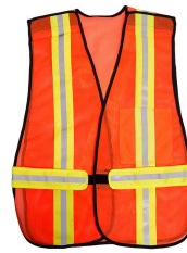
Road safety clothing - Kosto Construction and Traffic Control Vest SPI #: SVK371