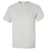
Sweaters and Polos - Technosport Gildan 10 oz Ultra Cotton Round Neck T-Shirt SPI #: VGI2000