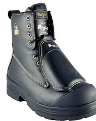
Work Boots with Metatarsal Protector - Royer 4D Realflex 8" Work Boots with External Metatarsal Protector