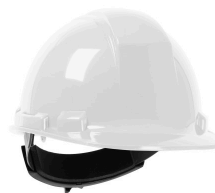
General Use Hard Hats - Dynamic Whistler Safety Hard Hat Type I Class E with SURE LOCK Fit System