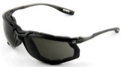
Safety Glasses - 3M™ Virtua Safety Glasses with Foam Gasket and Anti-Fog Coating