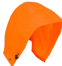
Caps and Hoodies - Kosto Ripstop Polyester Rainhood