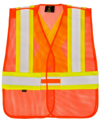
Road safety clothing - Kosto High Visibility Polyester Mesh Traffic Vest SPI #: SVK001