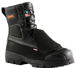
Work Boots with Metatarsal Protector - Unik SF89491 Extreme Condition Welder Boots