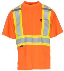
Sweaters and Polos - Kosto Breathable Hi-Vis T-Shirt with 4" Reflective Tape SPI #: VHK015