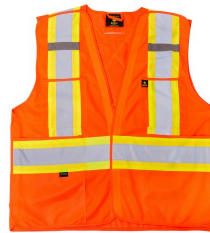
Road safety clothing - Kosto Breathable Polyester Traffic Vest with 4" Reflective Tape SPI #: SVK05