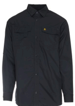
Work Shirts - Kosto Ripstop Snag and Tear Resistant Summer Work Shirt