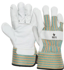
Leather Gloves - Kosto Full-Grain Leather Work Gloves with Cotton Back