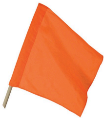
Flags - Traffic flag