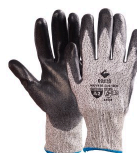
Cut-Resistant Gloves - Kosto Polyurethane Coated High Density Polyethylene Cut-Resistant Work Gloves