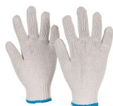
Knit Gloves / Cotton - Kosto Polyester and Cotton Knit Work Gloves