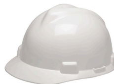
General Use Hard Hats - MSA V- Gard Slotted Hard Hat with Fas- Trac III Suspension