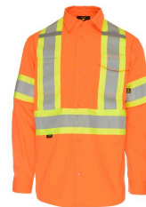
Work Shirts - Kosto Ripstop High- Visibility Summer Work Shirt SPI #: VHK060