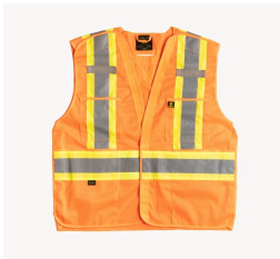
Road safety clothing - Kosto Reflective Safety Traffic Vest SPI #: SVK625