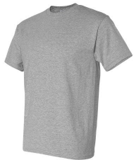
Sweaters and Polos - Technosport Gildan DryBlend Short Sleeve T- Shirt SPI #: VGI00