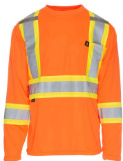
Sweaters and Polos - Kosto CSA Standard Hi Vis Work Shirt SPI #: VHK120