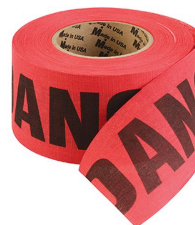
Barricade and Tapes - "Danger" barricade tape SPI #: SRD021