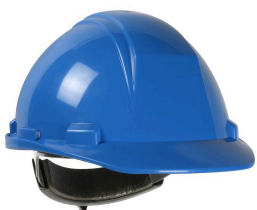
General Use Hard Hats - Dynamic Mont-Blanc™ HP542R Type II Class E High-Impact Protection Safety Helmet