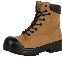
Lined Work Boots - Kosto Tork Nubuck Leather and Metal Free Work Boots