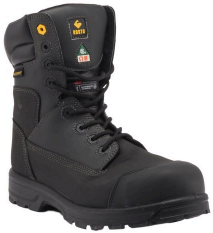
Work Boots - Kosto Cedrik Tek Leather Metal-Free Work Boots