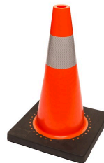
Traffic Cones - Kosto 18" Orange Safety Cone with 4" Reflective Band