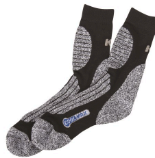
Footwear Accessories - Kosto Performance+ Coolmax Work Socks