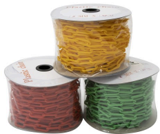
Traffic Cones - Kosto 100' Road Delimitation Chain