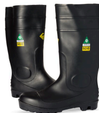
Waterproof Work Boots - Kosto PVC Steel Toe Waterproof Boots