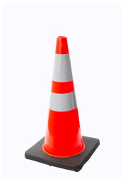
Traffic Cones - Kosto 28" PVC Traffic Cone with Reflective Tape