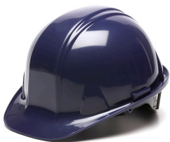
General Use Hard Hats - Kosto K- PRO Type 1 Hard Hat with Ratchet Suspension