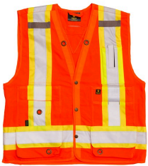
Road safety clothing - Kosto High-Visibility Polyester Surveyor's Vest SPI #: SVK04