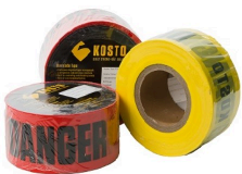
Barricade and Tapes - Kosto High-Visibility Barricade Tape for Hazards SPI #: SRD3