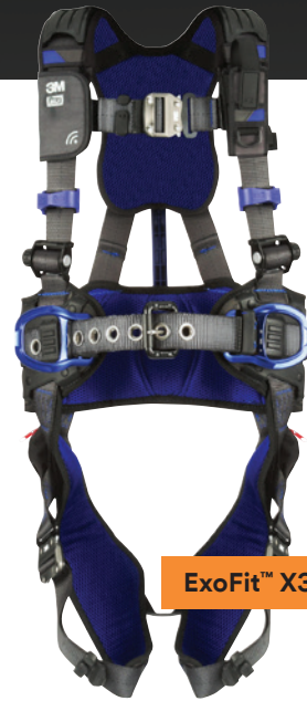
ExoFit™ X300 Harness