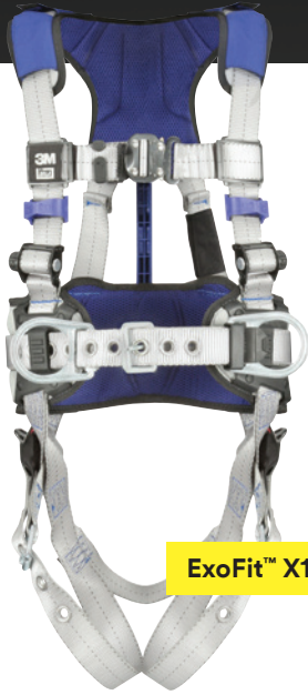
ExoFit™ X100 Harness