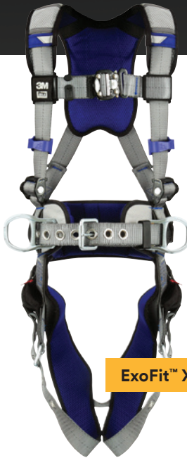
ExoFit™ X200 Harness