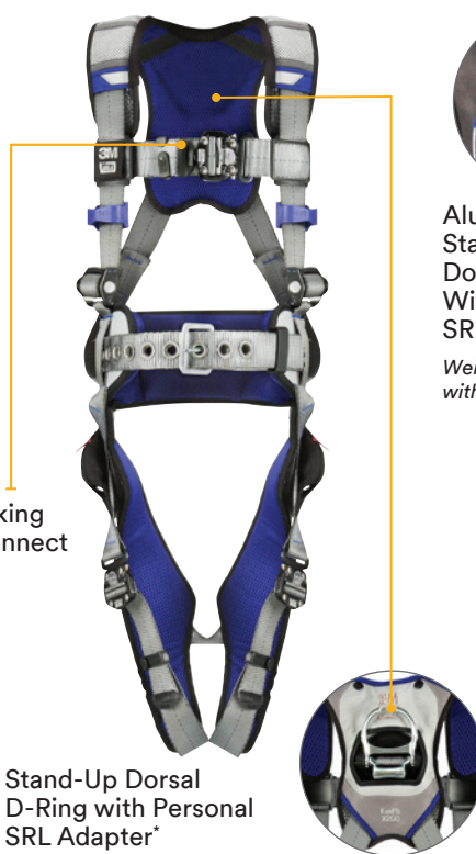
3M™ DBI-SALA® ExoFit™ X200 Harness